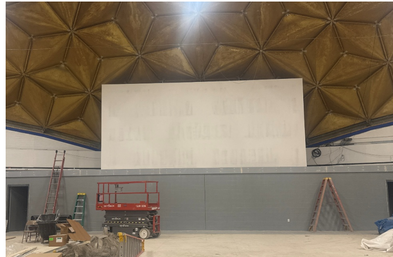
Dome Scoreboard Backboard