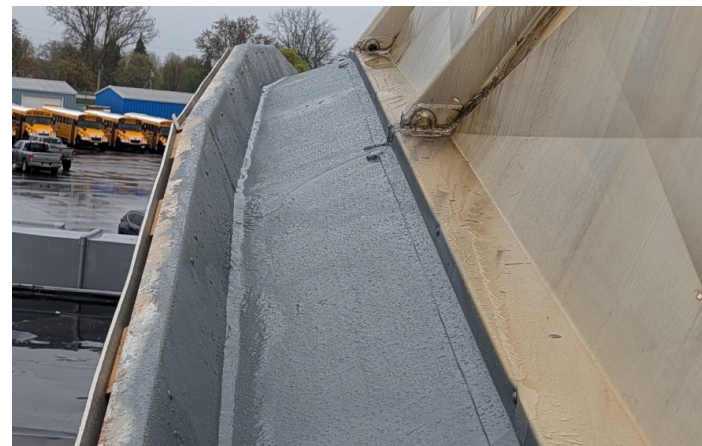
Dome Gutter Lining