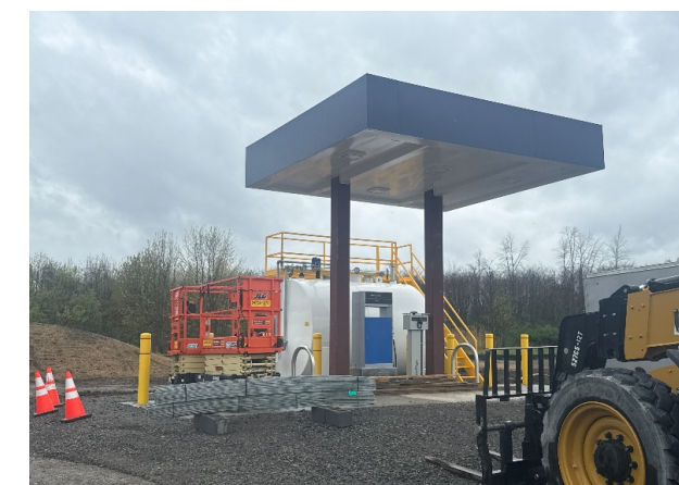
Fuel Island at New Transportation Facility