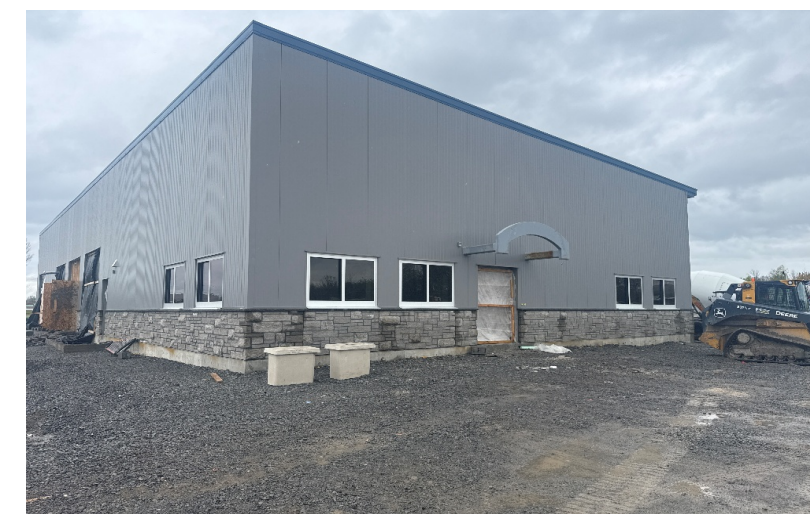
Windows and Entrance Canopy Framing at the Transportation Facility