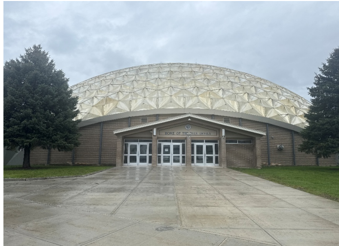
Gutter Fascia at the Dome