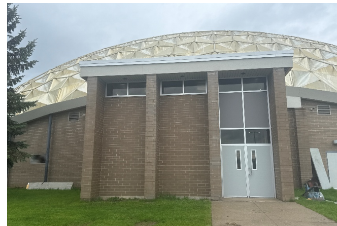
Dome South Stairtower