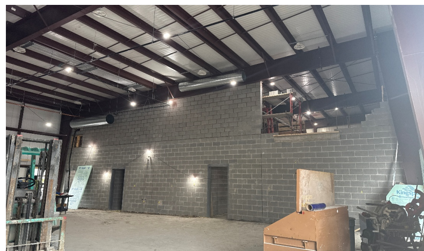
Interior Wall Construction at the Transportation Facility