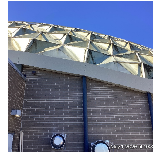
Gutter Fascia at the Dome