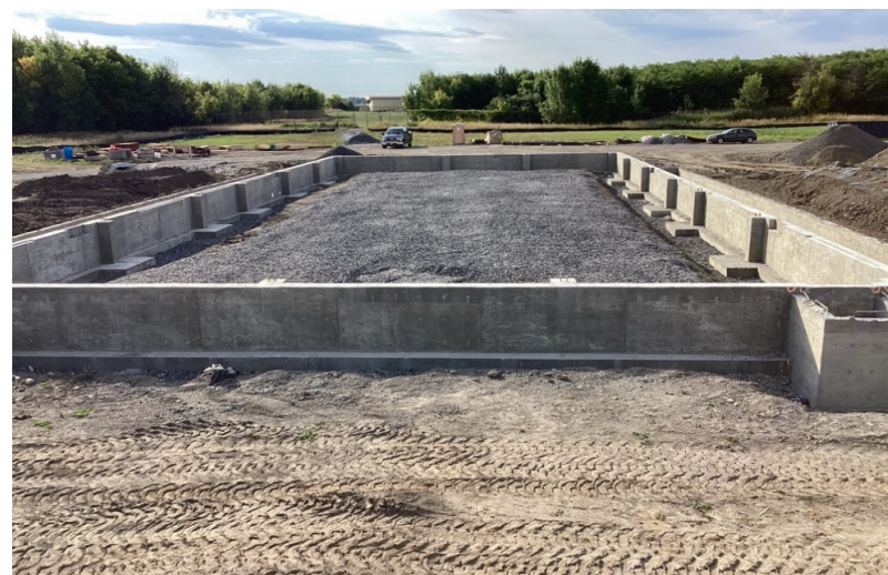
New Transportation Facility Foundations