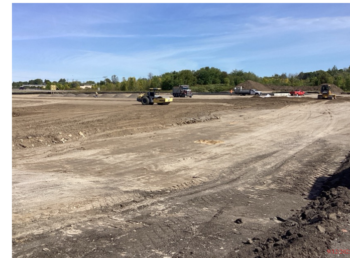
New Transportation Facility Site Development