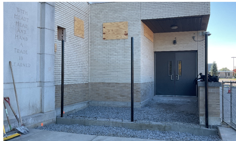
Create Dust Collector Pad and Fencing Installation