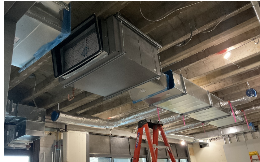
Create Classroom Ductwork Installation