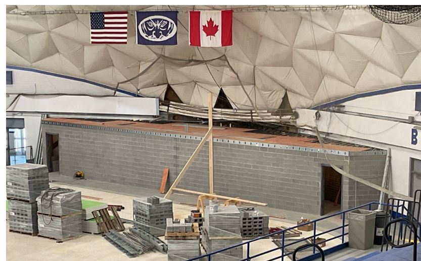
Gang-Style Bathroom Construction in Dome