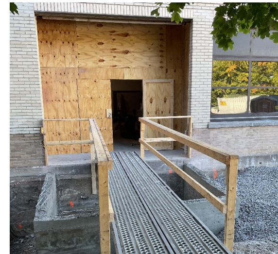
Create Overhead Door Opening and Concrete for Ramp