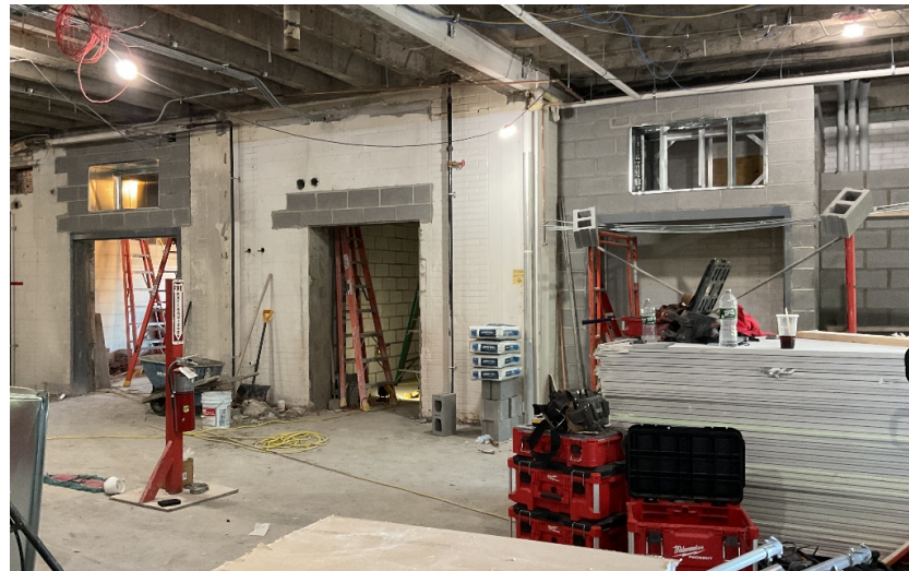
Create Room Interior Renovation