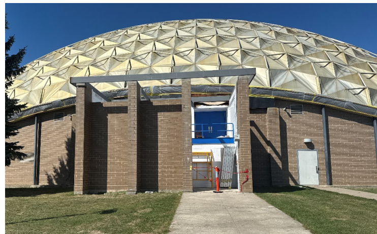
Dome South Stairtower Roof Framing and Gutter Fascia Removal